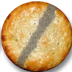
Chicken Mornay Pie Poppy Seed Stripe