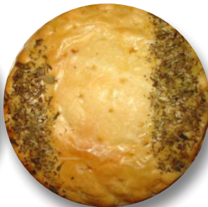
Steak Tomato & Onion Herbs on either side