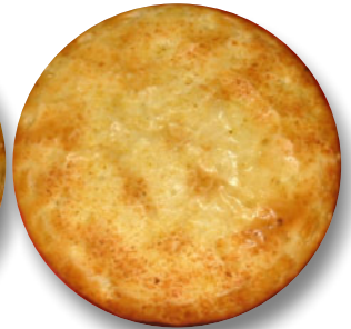
Curried Steak Pie Curry Powder