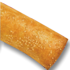
Chicken Cheese 'n Ham Roll Sesame Seeds