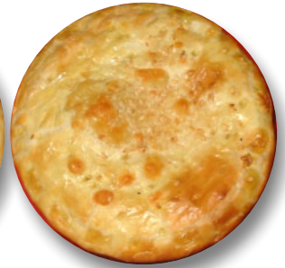
Steak & Cheese Pie Sesame Seed & Grated Cheese