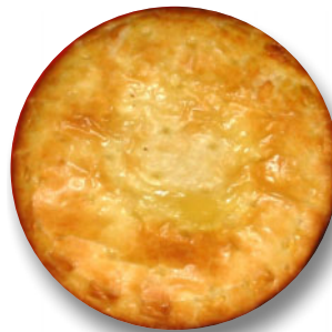
Steak Pie No marking

Postal: PO Box 5259, Daisy Hill, Qld 4127 Phone: 61 7 3299 5116 Fax: 61 7 3299 3677 Email: lorrie@lorries.com.au Website: www.gottalovealorries.com.au