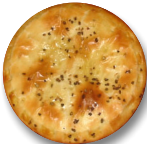
Pepper Steak Pie Pepper Corn