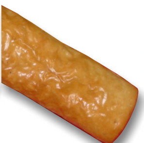
Gourmet Sausage Roll