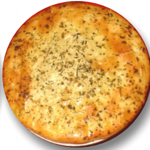
Steak & Pea Pie Parsley