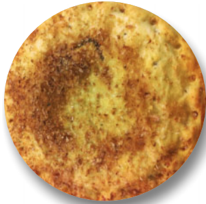
Beef Pie Bran Topping

Rocky Mountain Foods Pty Ltd ABN 59 085 071 021