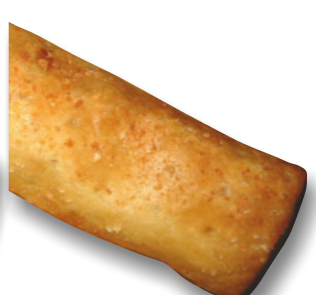
Cheese & Bacon Sausage Roll Bread Crumbs