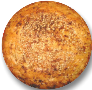
Thai Chicken Pie Sesame Seeds & Paprika