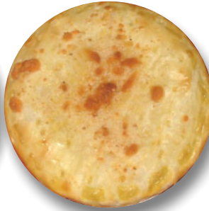
Brekky Pie Bread Crumb & Grated Cheese