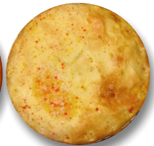
Chili con Carne & Cheese Pie Orange breadcrumbs on half