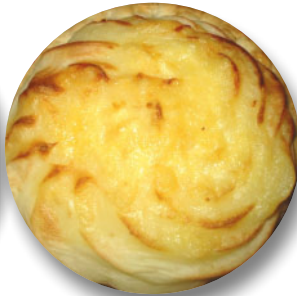
Steak & Potato Pie Potato & Grated Cheese