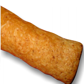
Cheese & Spinach Roll Bread Crumbs