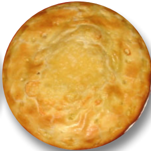
Steak, Bacon & Cheese Pie Grated Cheese