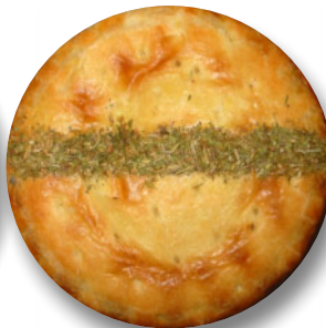
Steak & Kidney Herbs stripe