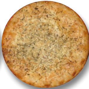
Steak & Mushroom Pie Herb & Sesame Seed