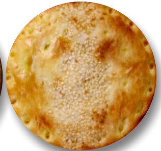
Chicken & Veg Pie Sesame Seed stripe