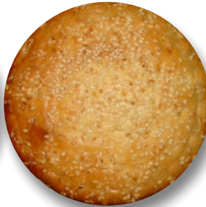
Corn & Asparagus Pie Sesame Seed